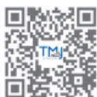
TMJ Interiors Website